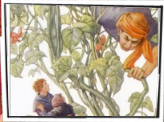
THE PICTURE ABOVE SHOWS THE GIANT AND JACK AND THE BEANSTALK

Pantomimes always have a 'principal boy' who is played by a woman! They also have an older woman or 'dame' who is played by a man! This is done to make the pantomime more funny! There is usually a pantomime horse or cow which is played by two actors in one costume! The audience are encouraged to join in the story and boo or hiss when the 'baddy' character comes on stage and cheer when the 'goody' character emerges! Songs are often sung which the audience are encouraged to join in with. Children from the audience sometimes join the actors on the stage to 'help' in a scene and are rewarded by sweets.